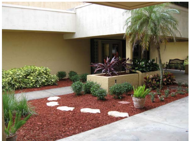
Photos of two areas of Phase I Landscape Challenge Top photo: Paurotis palm with Florida wart fern Bottom photo: Florida gamma grass, blue porter weed, and white lantana