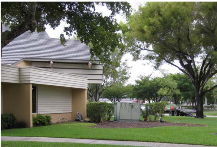
FPL box outside offices before