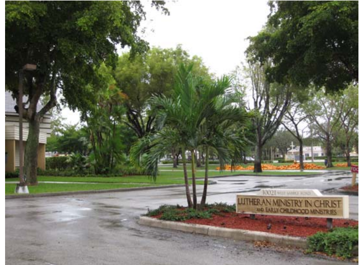
Adonidia palm cluster at entrance island

The final phase of the Landscape Challenge has been completed. As the accompanying photos show, not only does our local wildlife have a wonderful new place to rest, nest, and find food, but the very unattractive FPL box has totally disappeared from sight. Additionally, there is a nice adonidia palm cluster serving as a focal point at the east end of the entrance island. Again we thank the initial donor to this challenge, who had a vision for our campus, and all of those subsequent donors who believed in the vision. Our campus grounds now look a little bit more how God intended them to look! Again, a heartfelt thanks to all who contributed to this project!