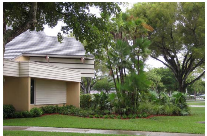
FPL box outside offices after